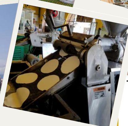
Top Photos (L-R): Vallarta Adventures sea lion tour, SHOT! SHOT! SHOT! & a local candy shop Bottom Photos (L-R): Some amazing ceviche, the Casa Magna Puerto Vallarta Hotel & freshly-made flour tortillas

We had dinner at one of the hotel's restaurants that night, La Estancia. Oh, did we mention our ocean view from the balcony of our room? Let's just say waking up to that view or enjoying a morning coffee on the balcony is everything a relaxing vacation should be!